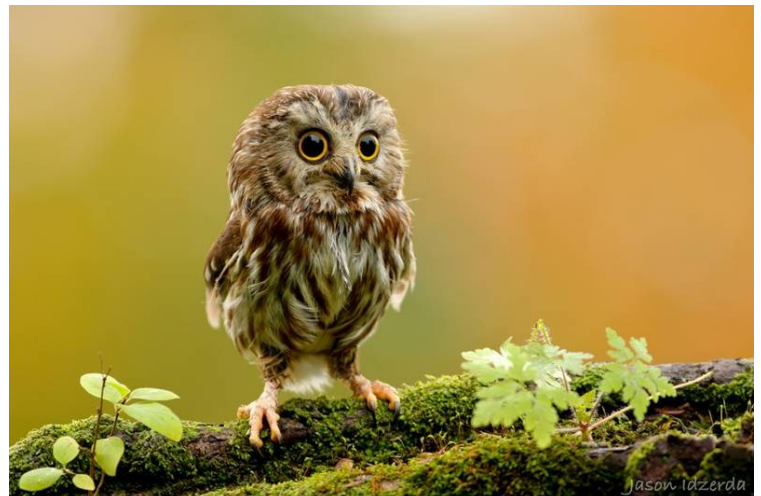
Northern Saw-Whet Owl "I thought I saw a putty kat"