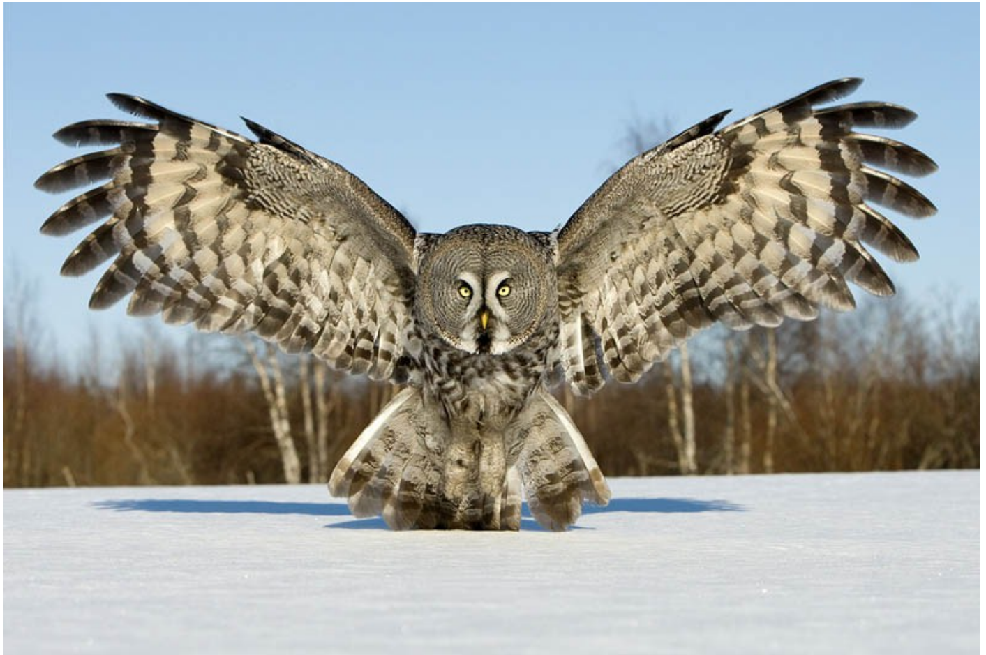
Great Grey Owl - Bad time to be a rodent